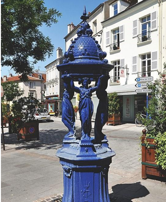
Wallace Fountain at 1 rue Paul Vaillant Couturier