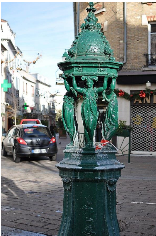
Wallace Fountain at 1 Place de l'Eglise