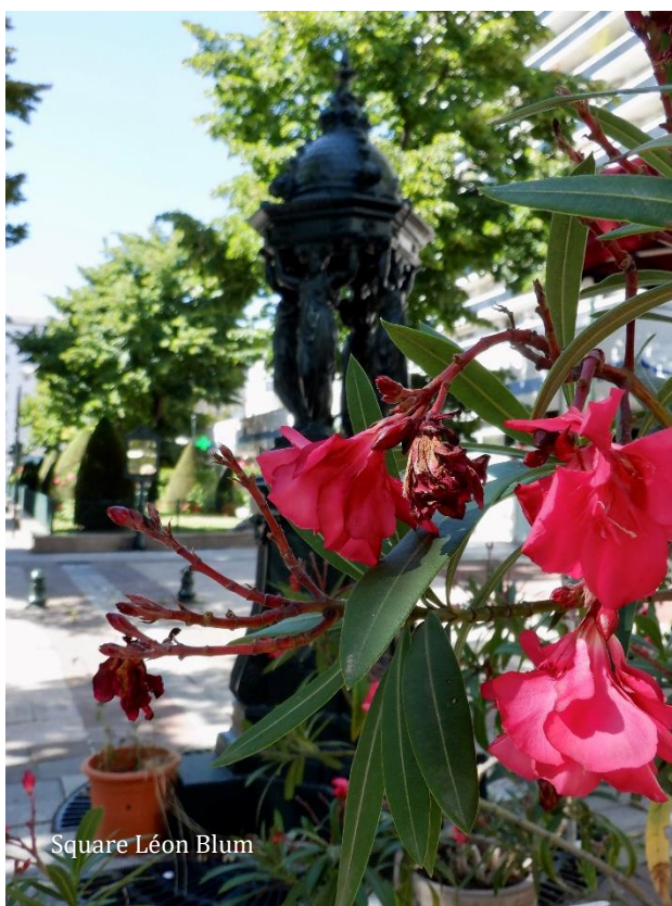
Square Léon Blum