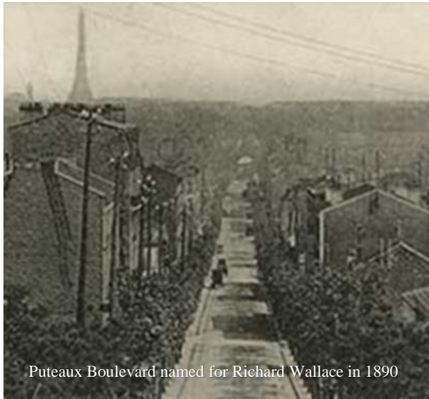
Puteaux Boulevard named for Richard Wallace in 1890