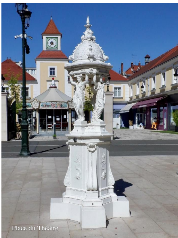
Place du Théâtre