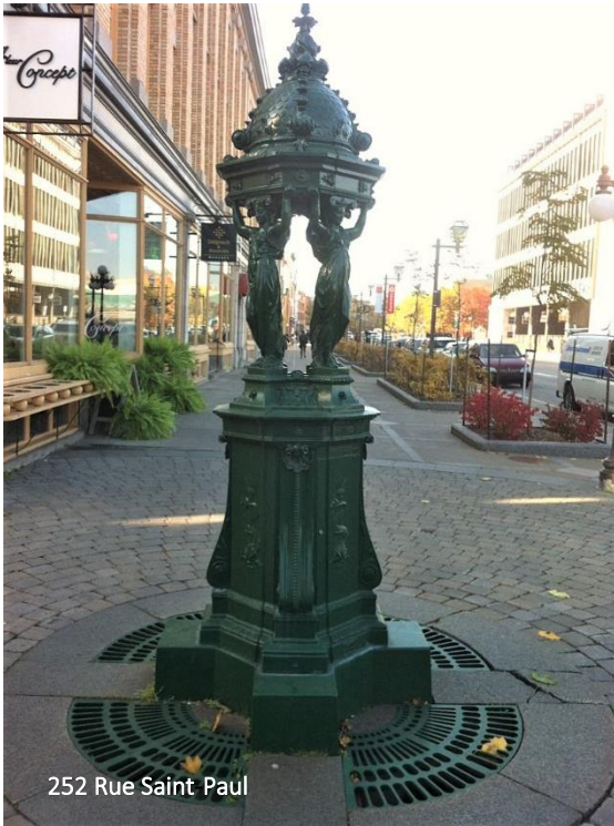
252 Rue Saint Paul

252 Rue Saint-Paul Québec, QC G1K 8C1, CANADA