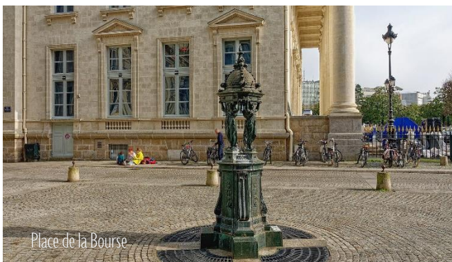
Place de la Bourse