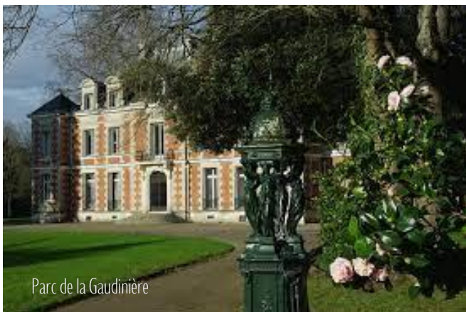
Parc de la Gaudinière

Jardin des Plantes – Two Fountains Boulevard de Stalingrad 44000 Nantes FRANCE