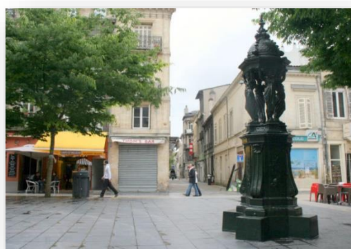
Place du Général-Sarrail