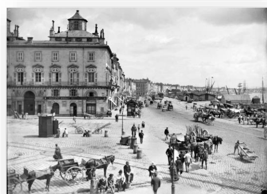
Fountain once on the waterfront