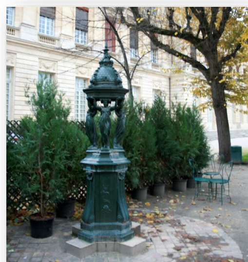
Garden of Palais Rohan, City Hall